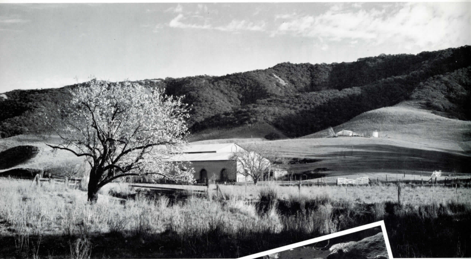
Winery and Tree